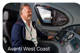
Avanti West Coast

Heritage, culture & tourism: promoting social and leisure travel that's crucial for people's health, wellbeing and enjoyment.