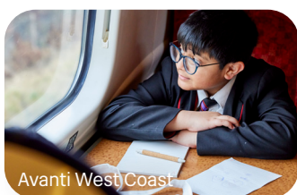
Avanti West Coast

We'll be uncovering the stories behind the tracks and trains, with an exciting programme that explores four themed pillars.